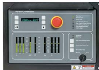
PowerCommand 2100 control operator/display panel