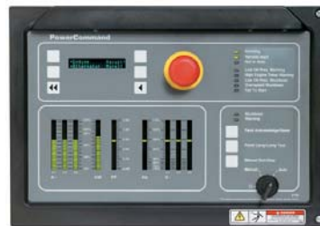
PowerCommand 2100 control operator/display panel